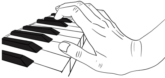
Figure 1: Incorrect hand position when playing the piano

To overcome the limitations of visual and auditory cues, research explored haptic feedback modalities that are only noticeable for the musician, mostly unobtrusive, and do not disturb others. In research, the term haptic refers to both tactile (e.g., vibration, pressure, etc.) and kinesthetic (e.g., muscle receptors, body pose, etc.) feedback [22]. Previous work showed that tactile feedback is effective for posture corrections [20, 23] and indicating directions [7] by guiding the focus of attention [5]. Users can discriminate different tactile patterns with high accuracy in physical activities. As a first step towards supporting musicians maintaining the correct pose while playing instruments, Grosshauser and Hermann [5] integrated a vibrotactile actuator in the violin’s bow to provide tactile feedback on the bow stroke, which had a positive impact on the performance. Exploring temperature as another haptic output modality, Peiris et al. [17] showed the potential of spatiotemporal thermal stimuli in a guidance scenario. Users could detect the direction of the thermal stimuli on the wrist with high accuracy. However, to the best of our knowledge, there is no prior work on using temperature feedback to support users in keeping the correct hand posture when playing instruments.