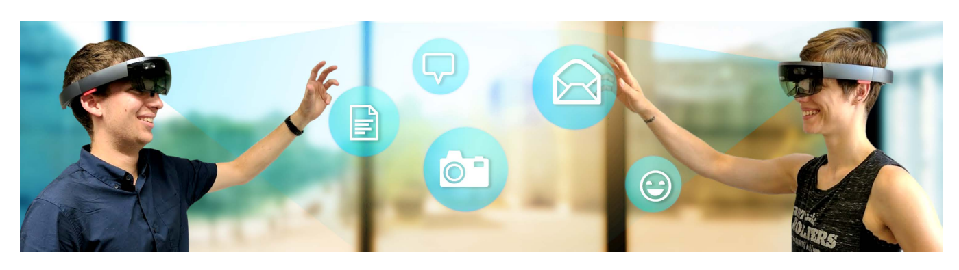
Figure 1: CloudBits provides users with additional information based on the topics of their conversation, proactively retrieved through zero-query search. The information is visualized as augmented information bits falling from the cloud .

Max Mühlhäuser max@informatik.tu-darmstadt.de TU Darmstadt, Germany