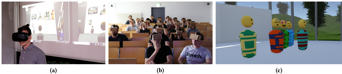
Figure 1: (a) A lecturer giving class in our Teachyverse environment, (b) photo of our in-the-field study with students attending a virtual lecture in Teachyverse, and (c) a group of students attending at the virtual lecture hall.